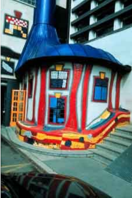
Detail of the Spittelau Heating Plant, Interior 2000 J. Harel, Vienna

Shortly after the fire damaged the Spittelau Heating Station, Mayor Helmut Zilk (Hel moot Silk) approached Hundertwasser about redesigning the plant's facade. As a staunch advocate of the avoidance of waste altogether, the artist initially declined the mayor's offer. After consulting with an environmentalist, however, Hundertwasser reconsidered the mayor's proposal. Hundertwasser decided that the redesign commission could be an opportunity to change the multi-purpose municipal plant into a work of art that was also environmentally sound.