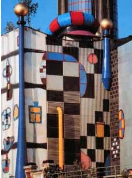
Detail of the Spittelau Heating Plant

Above the entrance where garbage trucks unload refuse, a fish-shaped banister surrounds a deck that has been planted with trees. Other areas that can support soil have trees and greenery planted. Soon, large trees will grow on the deck and in other concrete expanses of the plant. In a bit of whimsy, the cover of the ventilation shaft was designed to resemble Hundertwasser's trademark visor cap.